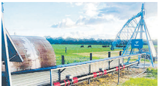
Above: H225MAX installed on a centre pivot in Marcollat, SA - 2022