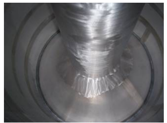
Photo3 showing funnel of top region