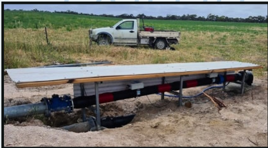
Above: Michael's H150MAX - on approx. 4,000ppm

“My Lucerne’s looking better than it ever has and I think I’m using less water now. Where there previously were salt rings there are now none.. I’m wrapped.”